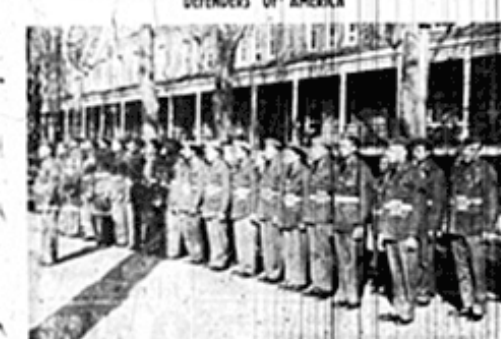
In the above photo may be seen representatives of thousands of Negro boys ready to defend their homeland in various parts of the world.

A group of defense units, this nation in that they, Negro, who, while exposed to war, will find the moment of triumph. See, on page 10.